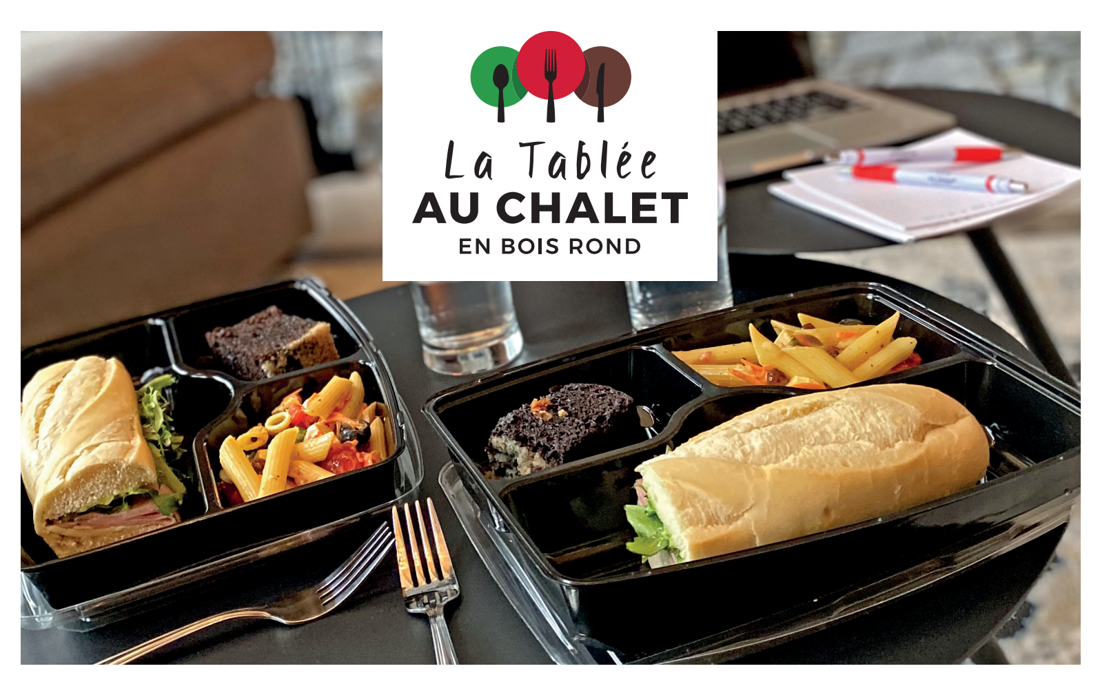
CATERING MENU 2024 | LUNCHBOX MENU