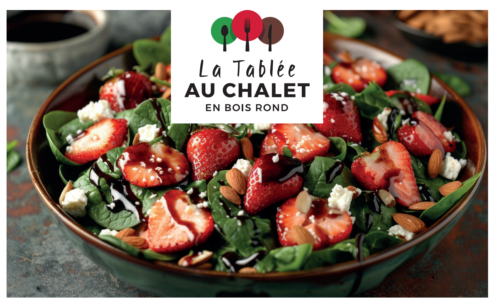
CATERING MENU 2024 | COLD BUFFET